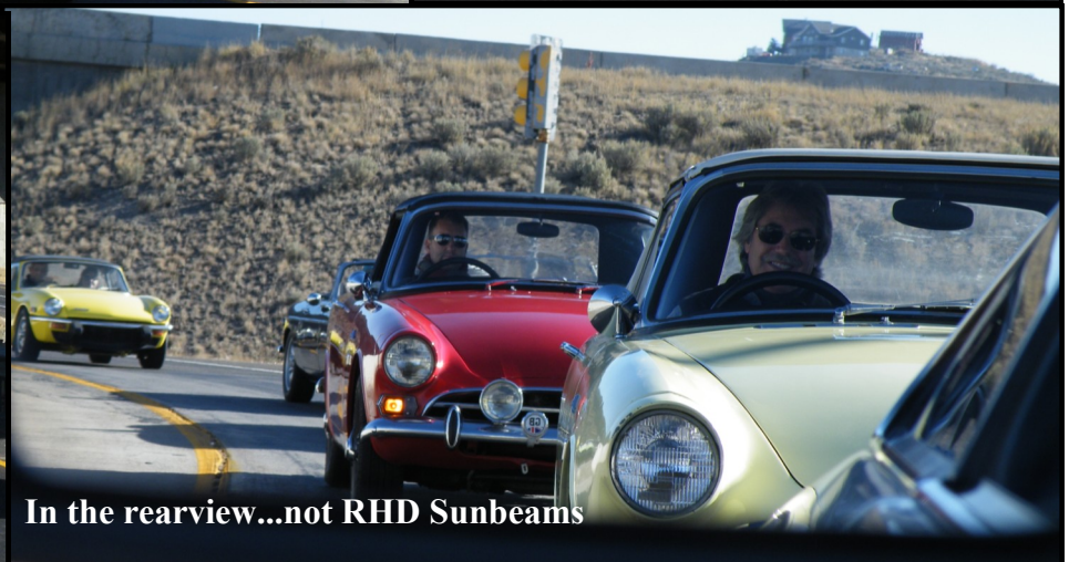
In the rearview...not RHD Sunbeams