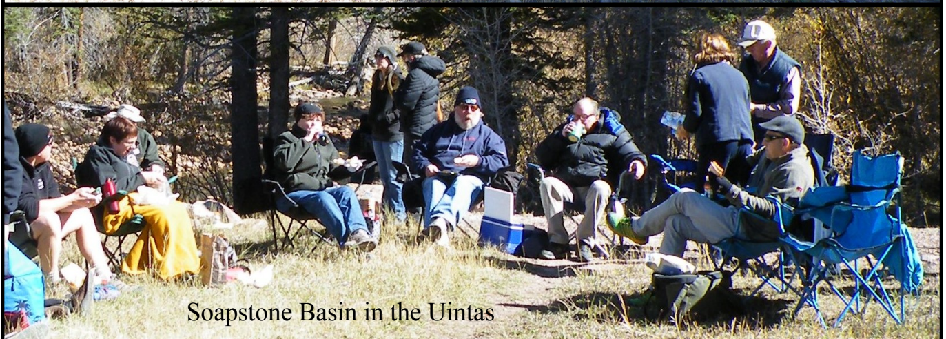
Soapstone Basin in the Uintas