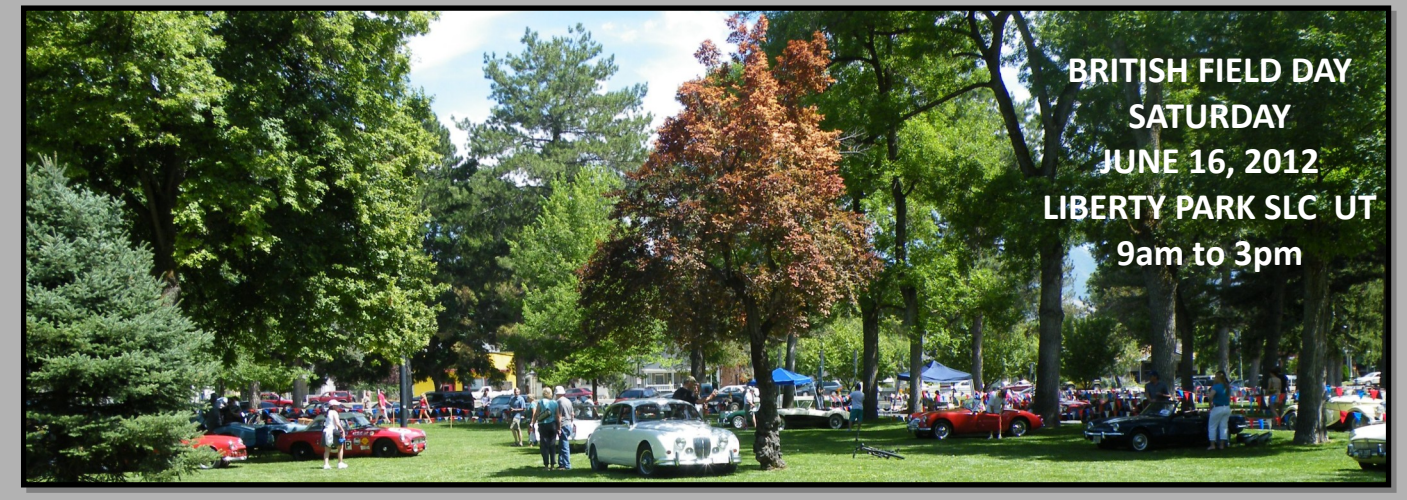
There's plenty to SEE , people to MEET , and things to DO ... ...at beautiful, shady Liberty Park on B ritish F ield D ay.

a gathering of Utah's British Car and Motorcycle Clubs and British vehicle owners of all types