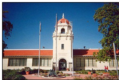
The Columbus Center. Located at 2531 South and 400 East in South Salt Lake City