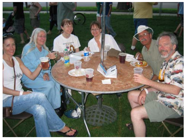
table Tongan, Native American, and Swiss goodies were sampled.

The food on offer was ethnically diverse as one might expect from the theme of the festival -- at our