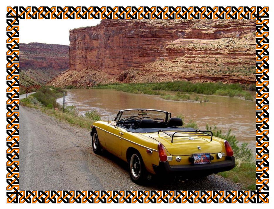
This Month's Featured Car

A Chapter of the North American MGB Register A Zone of the Vintage Triumph Register