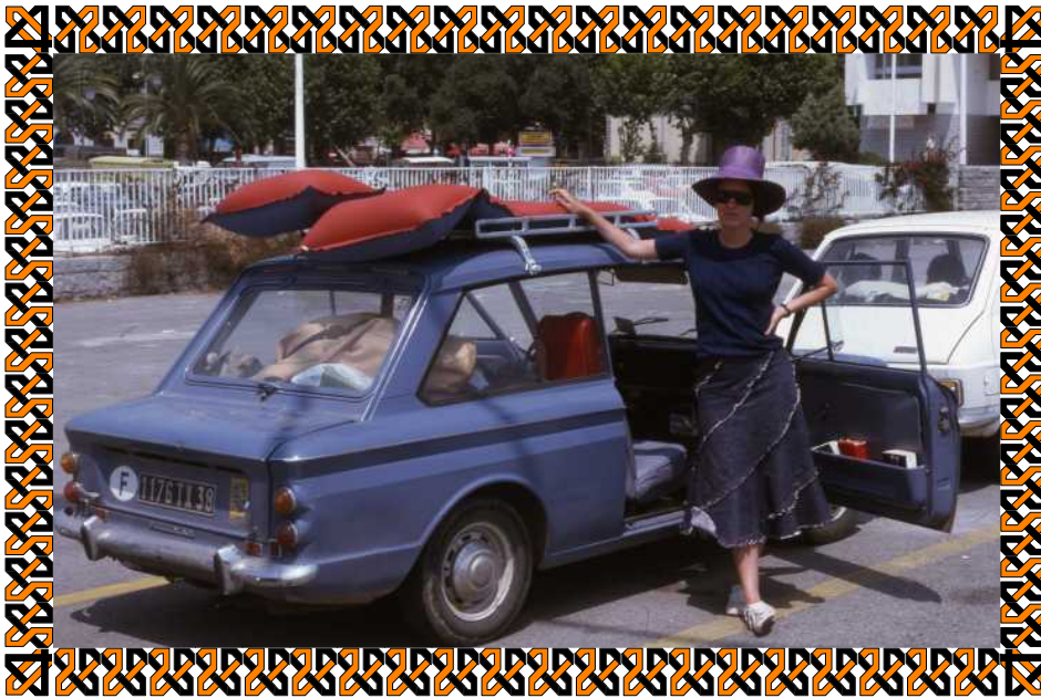
This Month's Featured Member Car

1448 North 100 West Bountiful, UT 84010-5977