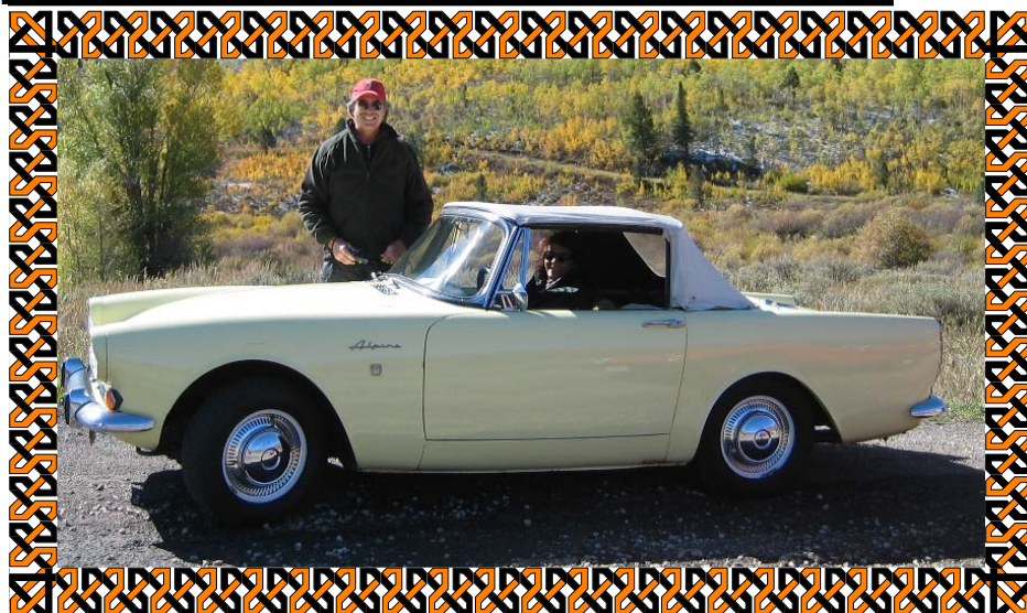
This Month's Featured Member Car

1448 North 100 West Bountiful, UT 84010-5977