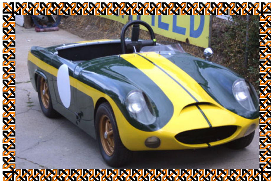
This Month's Featured Member Car

1448 North 100 West Bountiful, UT 84010-5977