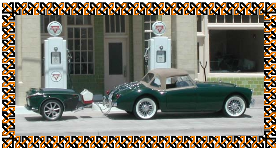
This Month's Featured Member Car

1448 North 100 West Bountiful, UT 84010-5977