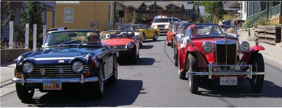
BMCUers get ready to rumble at last year's Miners Day parade.