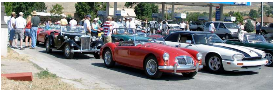
Formation flying at the Trappers Loop rest stop in Morgan