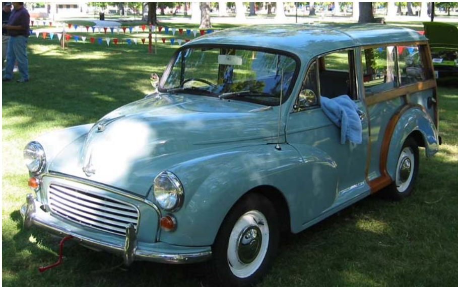
A shiny Morris Traveler (?) at Field Day. We hope the owner isn't throwing in the towel.