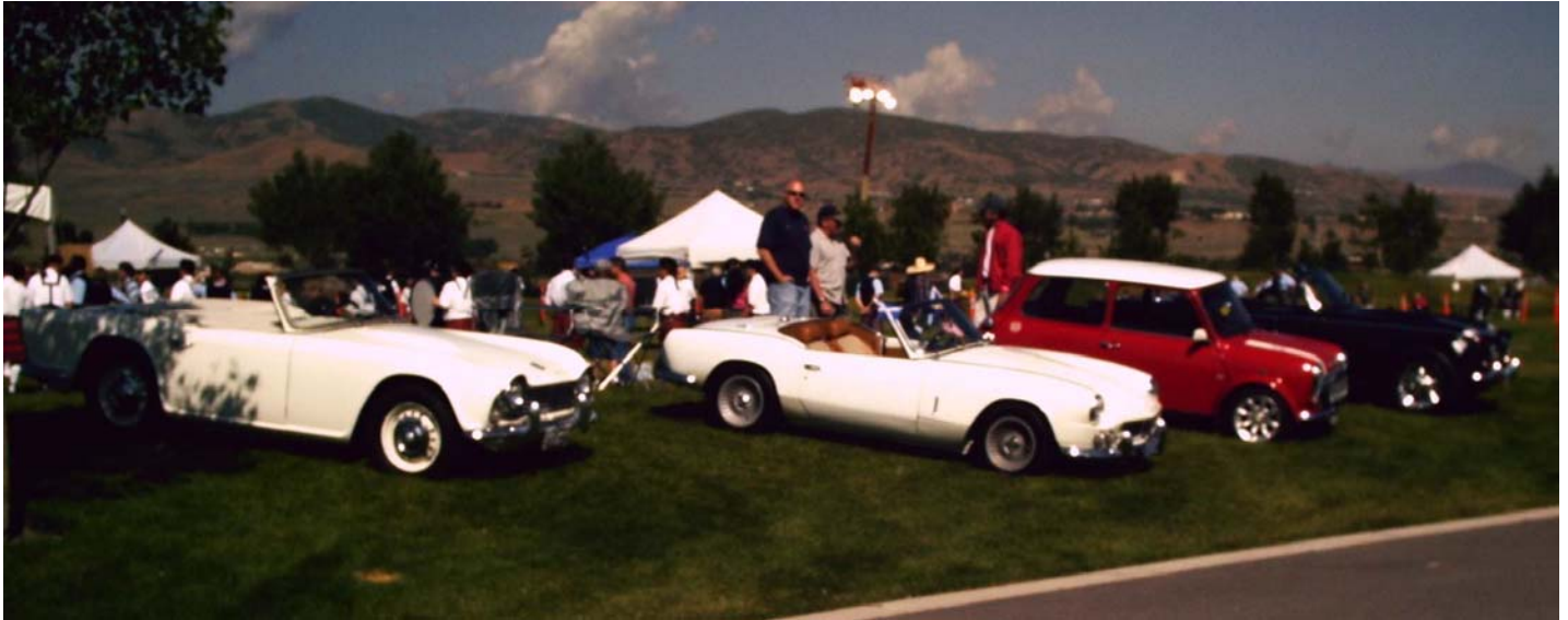
The BMCU line up at the 2006 Utah Highland Games