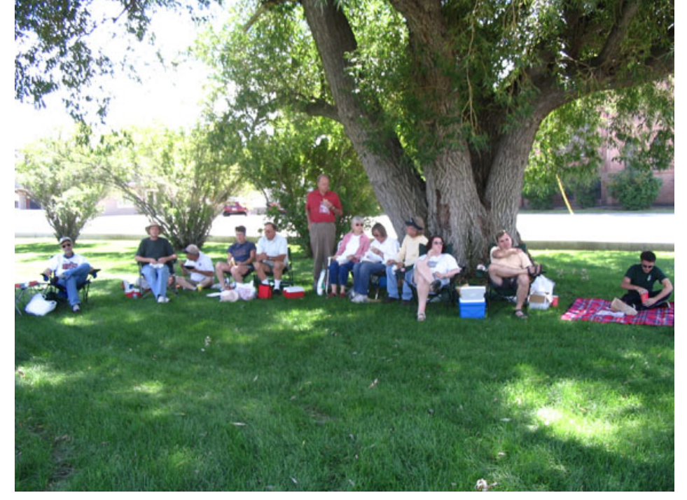
Part of the Alpine Loop participants enjoy a bit of shade after the run. See article on Page 3.