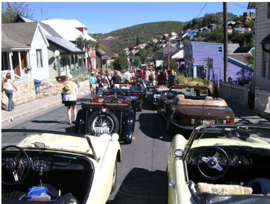
The BMCU was well represented at the Park City Miner's Day Parade. Here the cars line up for the start of the parade. Story on Page 2