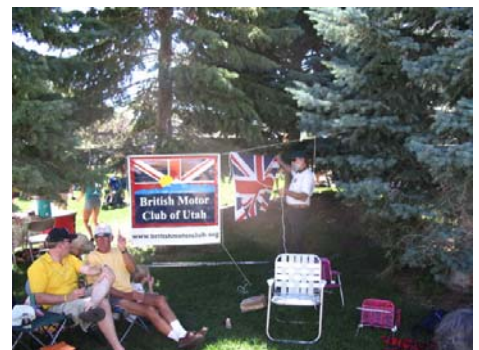
BMCU at the park