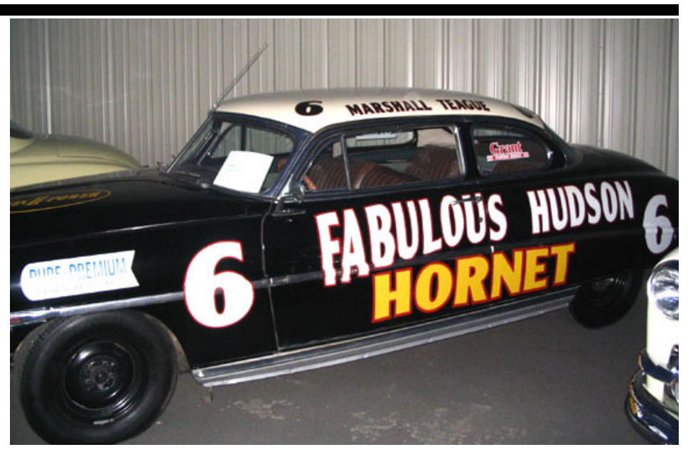
Beautiful Hudson Hornet racer on Display at "Rebels With A Cause"

Thanks for your patience, I *really* hope nothing like this ever happens again.