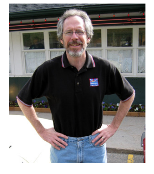
Is this the best model you could find?