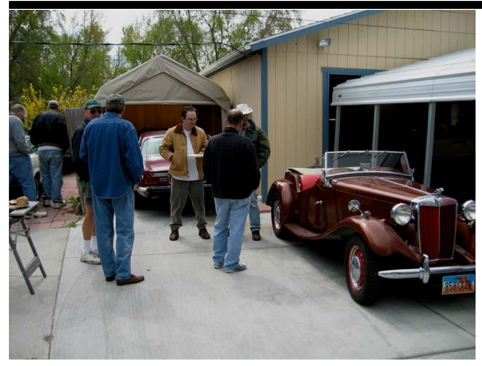
BMCU Members Enjoy Recent Tinker Day