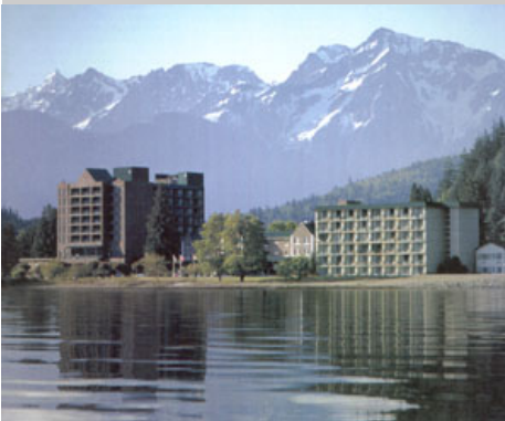
GoF West—Harrison Hot Springs

February 12, 2005: Potluck and Business Dinner.