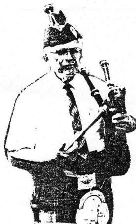
What British celebration would be complete without bagpipes?