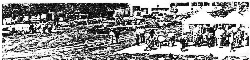
The view of the field shows a large crowd—cars and people!